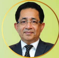
Chief Guest Mr. Joy Alukkas Chairperson & Managing Director Joyalukkas Group