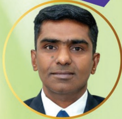
Inauguration by H.E. Satish Kumar Sivan Consul General of India, Dubai